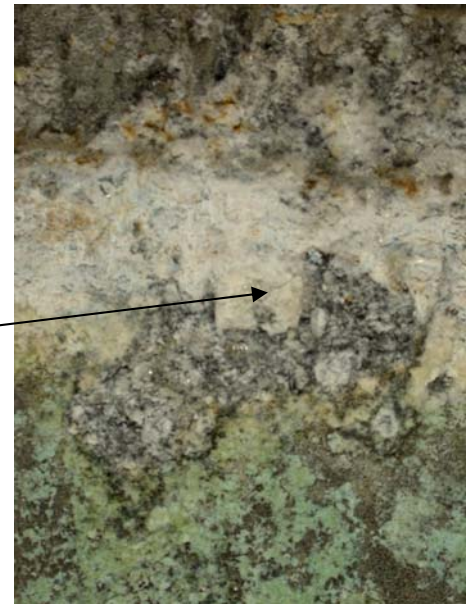
Pitting at the water line